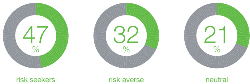
Global attitudes to risk

The Sage Business Index also found that in the new climate of economic confidence, business decision-makers are willing to take greater levels of risk. Nearly half (47%) of business leaders surveyed described themselves as risk-takers, with 73% saying they did so because they feel they need to take risks to succeed. While only 32% of business decision-makers described themselves as risk averse.