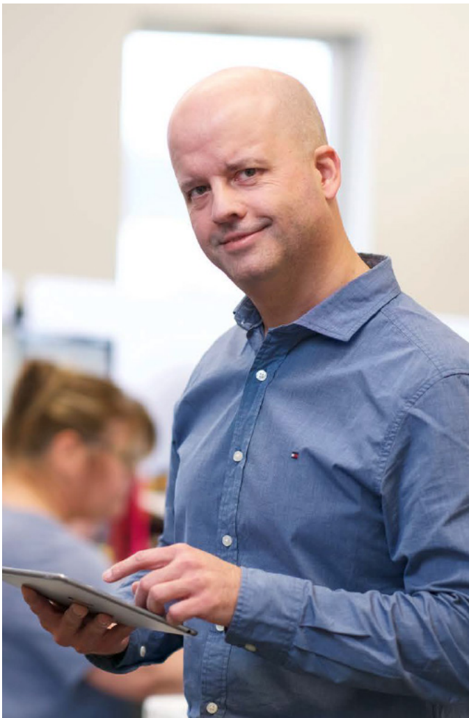
Weston Energy was facing several challenges with its legacy software.