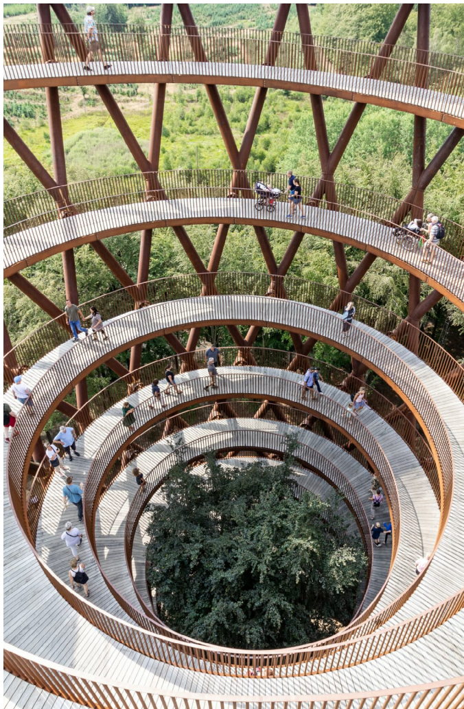
With Sage Intacct's robust project accounting capabilities, International Living Future Institute employee's time is tracked right in the system.