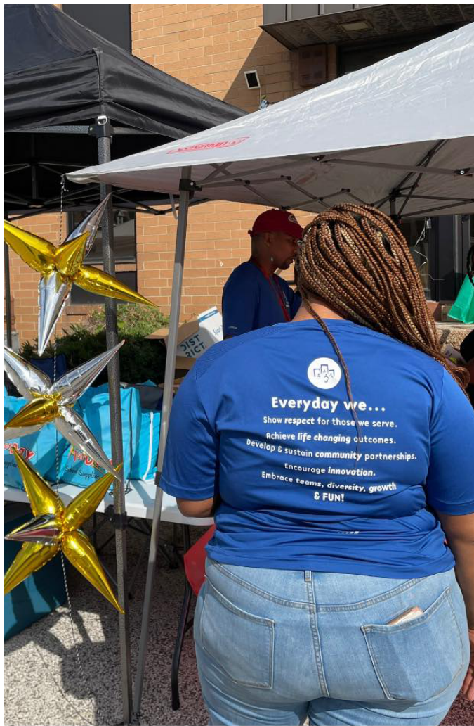
Faith selected Sage Intacct because it is a true cloud solution that delivered strong internal controls and an audit trail.