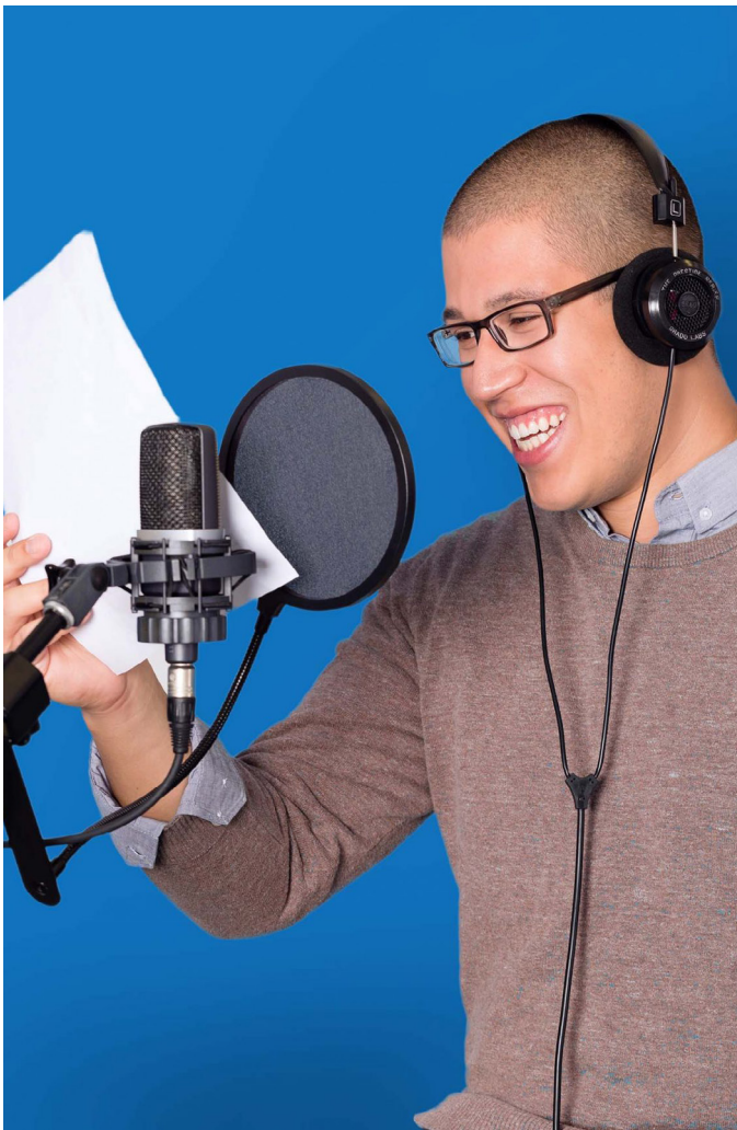
Anytime, anywhere remote access to Sage Intacct keeps the finance team connected and productive.