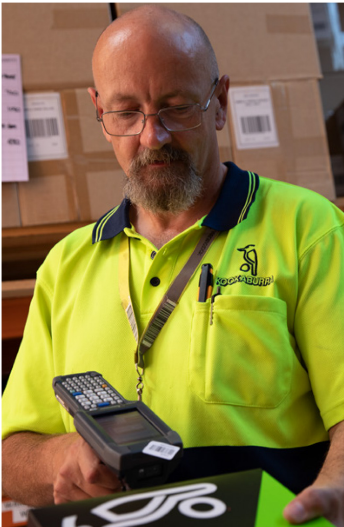
Sage X3 helps Kookaburra Sport increase productivity in the warehouse.

The chosen platform was Sage X3, a software suite that includes integrated functionality for financial management, sales, customer service, distribution, inventory, manufacturing, and business intelligence.