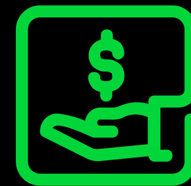
HR + Payroll