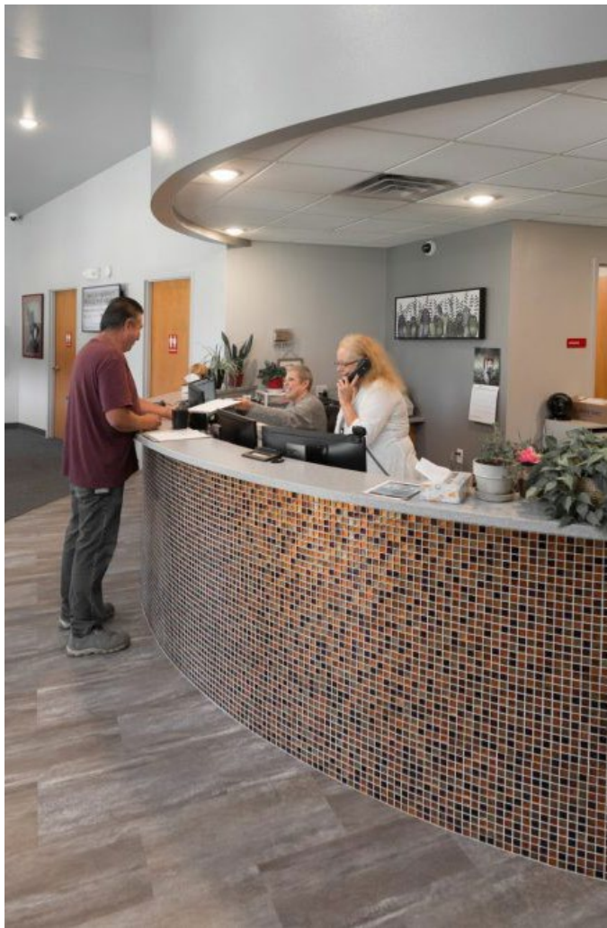
The finance team at Health Solutions appreciates the ease with which they can pull external data points into Sage Intacct.