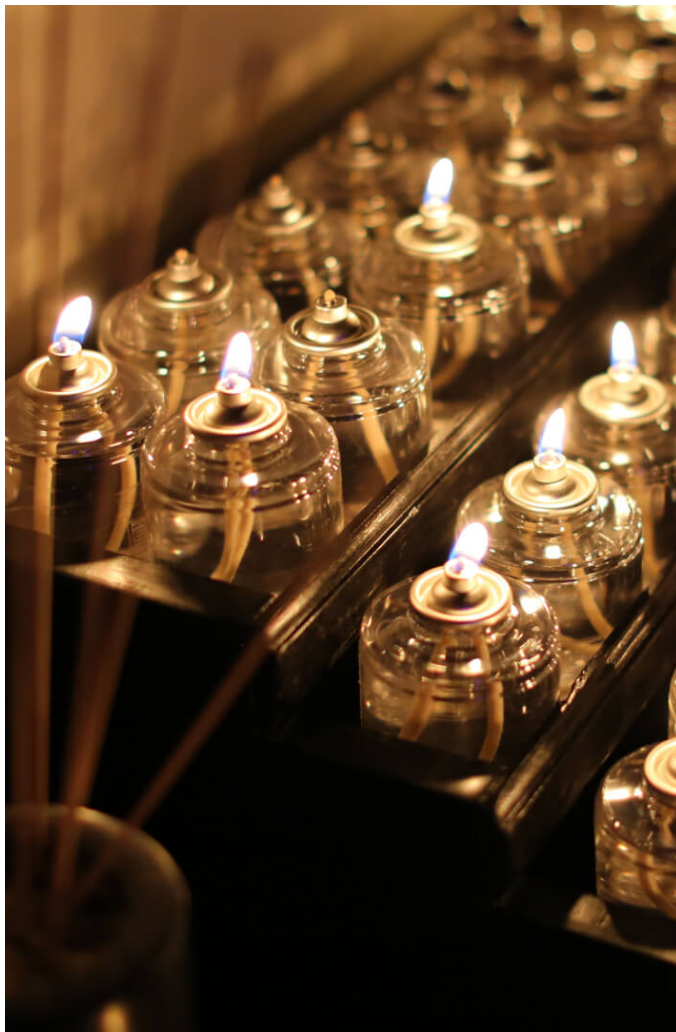
Sage Intacct has helped Seacoast Church cut bank reconciliation time by two days every month.