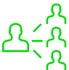
Payroll management and processing